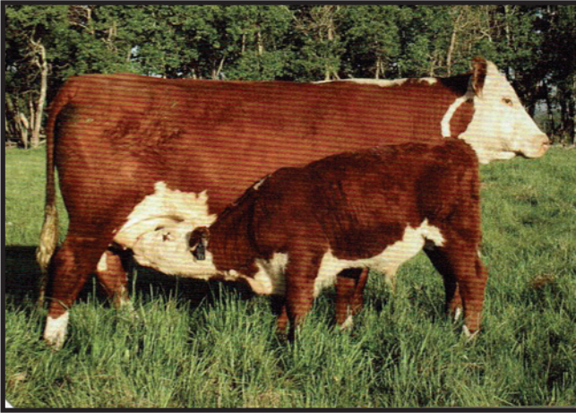
Remitall Mavrel 105N