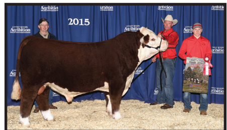
Remitall W Waterloo ET 12B sire of lot 6

Waterloo 12B is a total outcross sire to all North American bloodlines and was the 2015 Agribition res. Jr. champion and 2015 Olds Fall Classic Grand Champion bull. Sire of lots 1, 2, 6, 8, 9, 28.