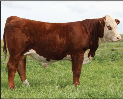
Remitall W GD Lawless ET 37C

Sold for $18,000 to Wooden Shoe Farms, ID.