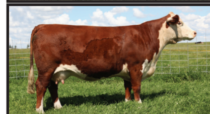
Glenlees 101N Bailey 78Y Dam of lot 48 embryos

Another great proven mating with this embryo offering. We have two bull calves in this sale lot 5 and lot 14 and two heifer calves being retained for the herd that are the same combination as this embryo lot. This mating is both highly maternal and performance driven!