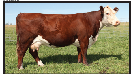
MHPH 118U Amber 118Z dam of lot 7

Start Me Up ET 7B's first calf crop is sensational. He consistently adds muscle shape, pigment and profile. We have also been getting great reports from all who have used him, his future as a sire looks extremely bright.