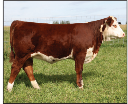
Remitall W Yellow Rose ET 11C

Sold for $18,000 to Wooden Shoe Farms, ID.