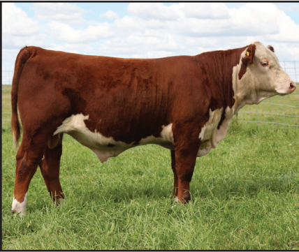
Remitall W 50 Shades ET 12C