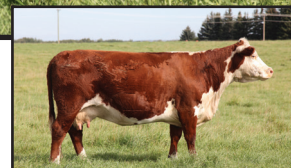
NGA 363R dam of lot 12