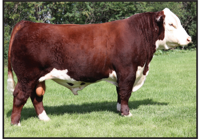
Remitall-W Rio Lobo ET 26C

2012 WHC Rancher Day Grand Champion Female.