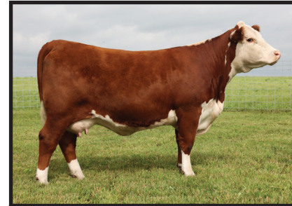
REMITALL-WEST YELLOW ROSE 2Y Dam of embryo lot 45 and lot 46

An exciting mating here. Yellow Rose 2Y is an elite donor for Remitall West and is the dam of herd sires Closing Time 10B and Moondance 40B and has four daughters in the herd. This mating represents proven genetics that are new and cutting edge. Yellow Rose 2Y has feature lot 3 bull calf Dream On 42D and lot 15 herd sire Moondance 40B also in this sale. Yellow Rose 2Y had a very successful show career winning Grand Champion Female at the 2013 Olds Fall Classic and Res. Sr. ylg heifer at the 2012 WHC, Yellow Rose 2Y was also at side her dam Whitney 411W when she was named 2011 Canadian Jr. National Grand Champion female.