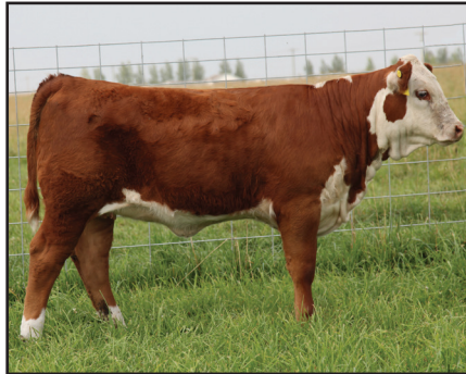
Remitall W GD Haylee ET 129C

Sold for $17,500 to Manchester Polled Herefords, SK.