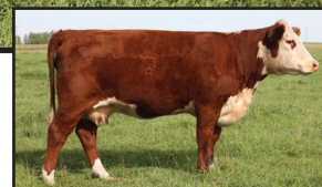
REM 38B dam of lot 13