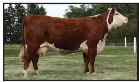
Dorbay Miss Whitney 411W dam of lot 6

Waterloo 12B is a total outcross sire to all North American bloodlines and was the 2015 Agribition res. Jr. champion and 2015 Olds Fall Classic Grand Champion bull. Sire of lots 1, 2, 6, 8, 9, 28.