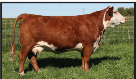
Remitall West Rita ET 25A dam of lot 16 Rita 25A is a powerhouse female with exceptional udder quality.

Rita 7D is a fantastic heifer to lead off this group! She has been a favorite here since birth. Rita 7D is super long bodied, beautifully balanced and feminine. The Rita cow family is renowned for gorgeous udders, outstanding milk flow and broodiness; we believe that Rita 7D will be a perfect example of this. Rita 7D's dam is a powerfully made Wonder daughter and her sire Hi-Tech 17A was the second-high selling bull in Topp's 2014 sale. Rita 7D is a true genetic gem and offers strong numbers right across the board!