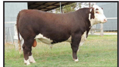
Days Calibre G74 sire of lot 21

ALLENDALE VAGABOND A74 ALLENDALE MARLINE X185 ALLENDALE ROBIN HOOD Z239 ALLENDALE DAWN A150 MERAWAH THUNDER W31 MERAWAH SHAMROCK N89 MERAWAH MISSOURI MERAWAH SHAMROCK M60