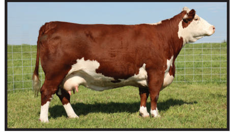
Remitall Marvel 78T grand dam of lot 18 A highly influential and maternal female in the Remitall West program. She has produced herd sires Game Day 74Y, Chicago 83Y, Havana 33A, Rio Lobo 26C, 50 Shades 12C and donor female Marvel 76Y.