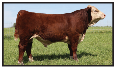
Remitall W Start Me Up ET 7B full brother to lot 4

This powerful donor female is one of the most prolific we've produced. Her special progeny are featured as lot 4, 8, 9, 10, 18, 19.