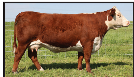
Remitall Belle 132U dam of lot 33

Exposed to Remitall W BNC Hot Pursuit 47C May 17 2016 to August 16 2016.