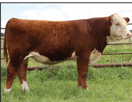
Remitall W Monty 15C