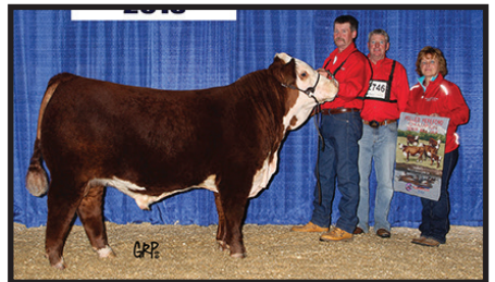
MHPH 521X Action 106A sire of lot 34

A bull that adds extra thickness and shape to his progeny.