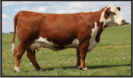
Remitall Rita 13T grand dam of lot 16 Rita 13T is a super donor cow that is highly maternal and consistent in producing top progeny. Rita 13T is the anchor of the Rita cow family here at Remitall West.