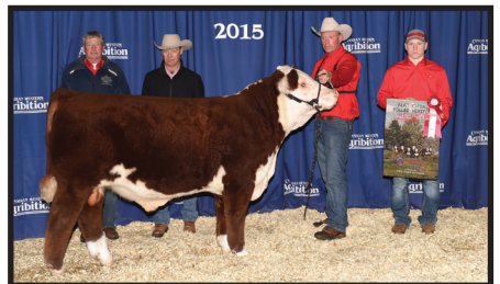
Remitall W 50 Shades ET 12C

You can easily see the quality and consistency that the Marvel 78T progeny have. Marvel 78T is a deep, big bodied and prolific donor female.