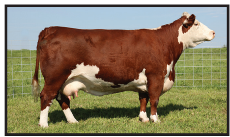
Remital Marvel 78T grand dam of lot 19 Marvel 78T is a true gem in terms of broodiness, udder quality, genetic strength and consistency of production.

Marvel 6D is a tremendous full sister to lot 18 and herd sire Start Me Up 7B; she has been a favorite here since birth! This heifer is a beautiful deep cherry red, thick made, smooth shouldered, easy keeping and fully pigmented all in a gorgeously balanced package. Marvel 6D is a highly maternal female and has future donor cow written all over her. She is the type of female we would love to have a whole herd of!