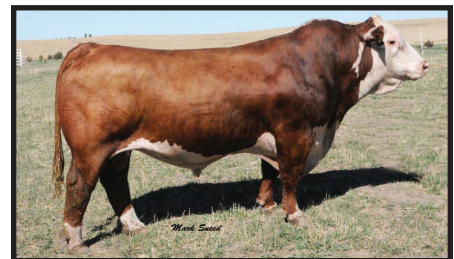
TH 223 71I Victor 755T sire of lot 11

REMITALL PATRIOT ET 13P REMITALL MARVEL 78T REMITALL MAVREL 105N