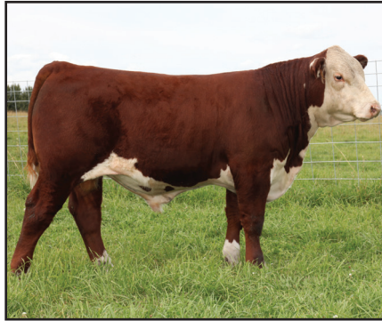
Remitall W Rio Lobo ET 26C