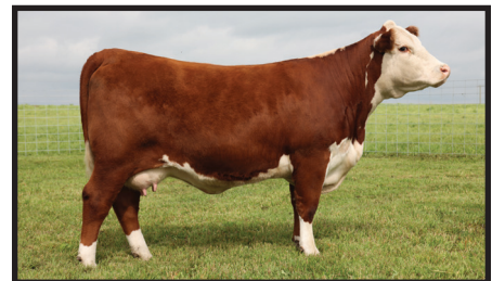
Remitall W Yellow Rose 2Y dam of lot 3

2014 record selling bull in Canada at $165,000 to Topp Herefords ND and Castle Polled Herefords OK. His first crop of calves are some of our best and are featured as lot 3, 5, 7, 12, 14, 17, and 29.