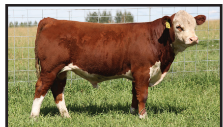
Remitall W Far Cry ET 14C