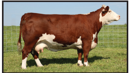
Remitall Marvel 78T dam of lot 20

Marvel 105D is a deep and smooth made, easy-keeping heifer. She certainly resembles her dam Marvel 78T who is the most influential female in the Remitall West herd. Marvel 105D's sire, Boyd Banker 0015 is renowned for his maternal strength. Marvel 105D offers you unlimited breeding opportunities with her outstanding pedigree and strong numbers. Full sister to last year's high selling bull at $32,000 Remitall W 50 Shades ET 12C.