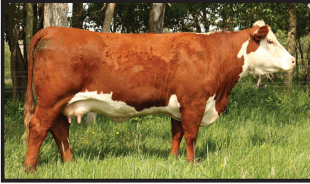
Remitall Marvel 120S grand dam of lot 32

Exposed to Remitall W BNC Hot Pursuit 47C May 17 2016 to August 16 2016.