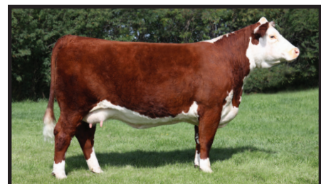
Remitall West Belle 36B maternal sister to lot 33

A big hipped, deep made female that adds power and performance to her progeny.