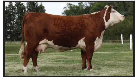
Dorbay Miss Whitney 411W dam of Lot 1.

Waterloo 12B as a sire adds muscle, strength of bone and eye appeal to his progeny. He offers new and exciting genetics to the Hereford breed in North America. Waterloo 12B is owned with Glenrose Polled Herefords AB.