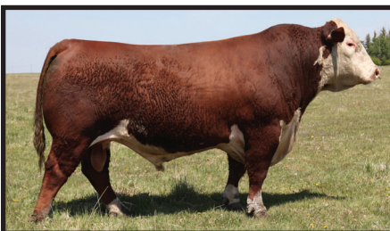
Remitall West Havana ET 33A sire of lot 32

RVP STAR 533P CAN-AM ET 57U HF 74M LIMELIGHT LADY 42P REMITALL PATRIOT ET 13P REMITALL MAVREL 105N KCF BENNETT 3008 M326 SHF GOVERNESS 236G L37 REMITALL PATRIOT ET 13P REMITALL MARVEL EUDORA 125E