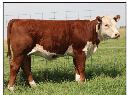
Remitall W GD Rose ET 16C

Sold for $8000 to Dorbay Polled Herefords, ON.