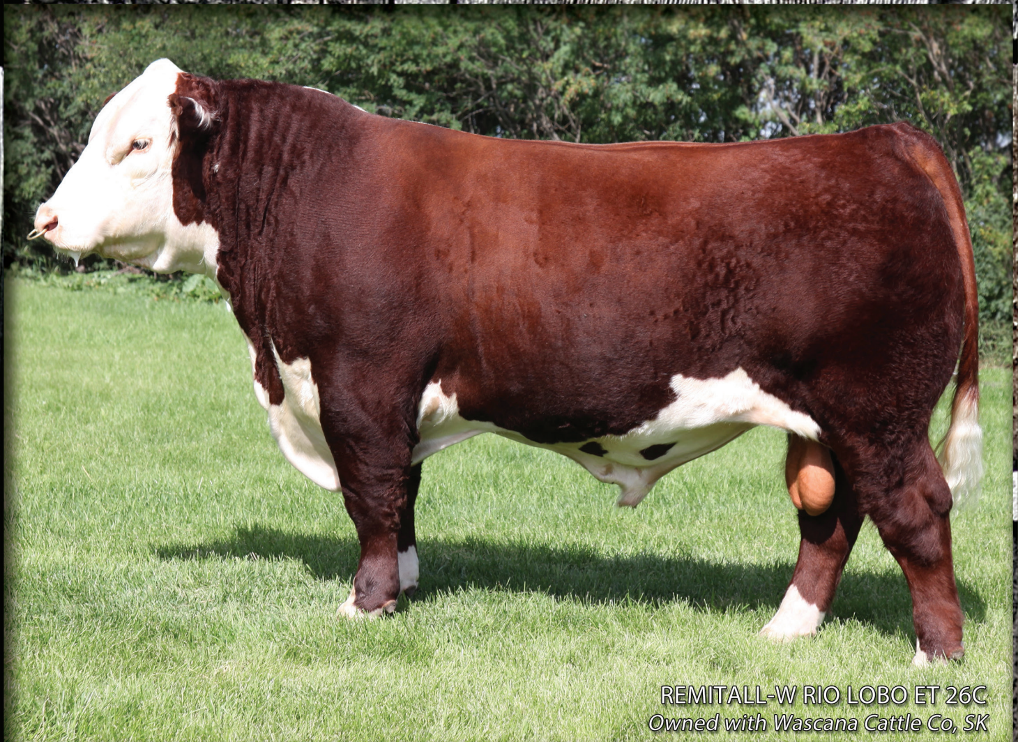
REMITALL-W RIO LOBO ET 26C Owned with Wascana Cattle Co, SK