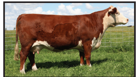
Glenlees 101N Bailey 78Y dam of lot 5

2014 $165,000 Canadian record selling bull to Topp Herefords ND and Castle Polled Herefords OK.