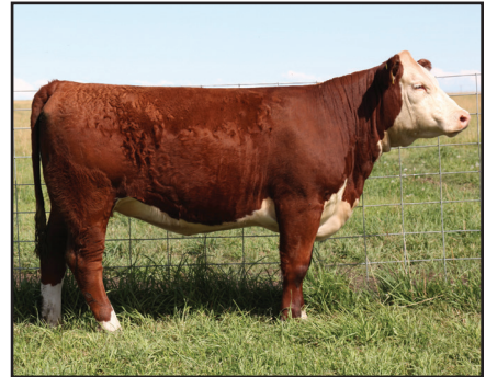
Remitall West Marvel 46B

Sold for $14,750 to Medonte Highlands Polled Herefords, ON.