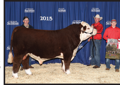
Remitall W GD Waterloo ET 12B Sire of embryo lot 45 and lot 46