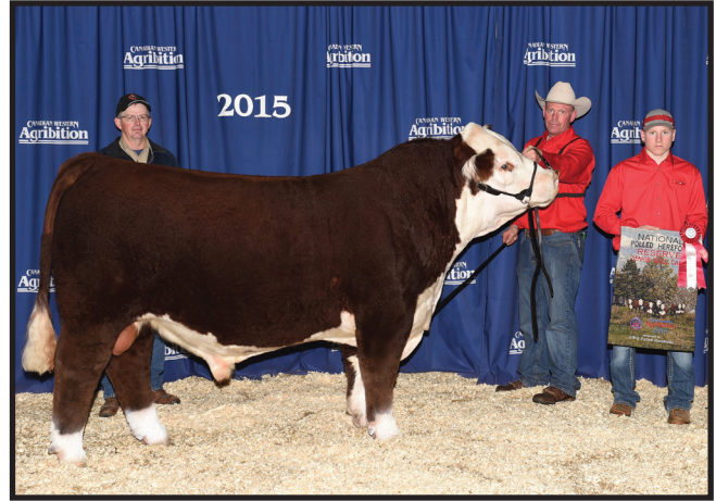
Remitall W GD Waterloo ET 12B

Sensational new sire of embryo lots 41 and 42