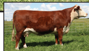
AHL 78Y dam of lot 14