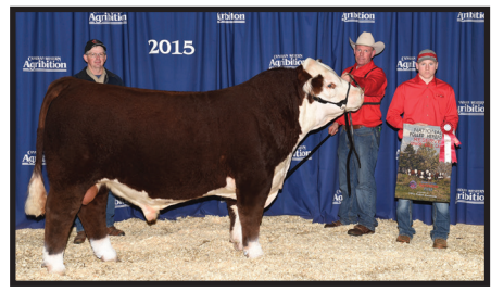
Remitall W Waterloo ET 12B sire of lot 8

The new and dynamic outcross sire for North America. 2015 Agribition res. Jr. champion and 2015 Olds Fall Classic Grand Champion bull.