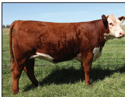
Remitall West Marvel 31B

Sold for $8000 to Dorbay Polled Herefords, ON.