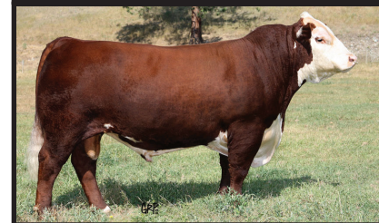
CB 57U Can Doo 102Y Sire of lot 47 embryos