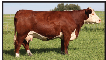
Remital West Marvel ET 76Y dam of lot 19 A super donor female that continues to impress us with her maternal power and outstanding progeny.

Marvel 6D is a tremendous full sister to lot 18 and herd sire Start Me Up 7B; she has been a favorite here since birth! This heifer is a beautiful deep cherry red, thick made, smooth shouldered, easy keeping and fully pigmented all in a gorgeously balanced package. Marvel 6D is a highly maternal female and has future donor cow written all over her. She is the type of female we would love to have a whole herd of!