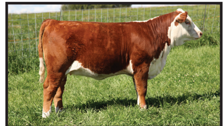
Remitall W Bailey 121D

RU 20X FUTURE 65F MHR 2B MILDRED 76B 56D NJW Z17 VAQUERO 25C BLAIR-ATHOL LADY GRACE 14F RU DUSTER 60D SVR RUSHMORE'S BEAUTY 241E REMITALL ADMIRAL 48A CHF 117P MISS PHENOM STICK 19Z