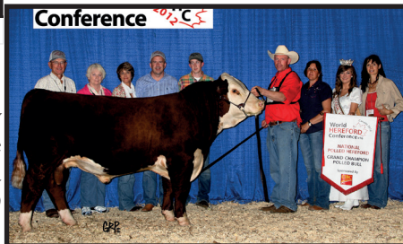
Remitall West Game Day ET 74Y Sire of Lot 30

Here is a special combination of one of our newest young donors Yellow Rose 2Y to the 2012 WHC Grand Champion Bull Remitall West Game Day ET 74Y. This is fresh new cutting edge genetics that will give you a leg up on the competition. Study Yellow Rose's heifer calf that sells as lot 9 and it won't be hard to imagine what her Game Day babies will look like.