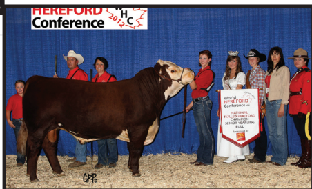
CB 57U Can Doo 102Y

A proven great mating here. A full sib to these embryos sells as lot 5. We were so impressed with Marvel 59A that we recreated the mating in a flush. Can't wait for them to be born 2013. The dam Marvel 76Y is a highly productive, fertile young cow with impeccable udder quality and pedigree. The sire Can Doo 102Y is the 2012 WHC Reserve Grand Champion Bull.