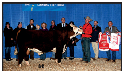
Remitall West Chicago ET 83Y 2012 Toronto Royal Grand Champion Bull. Owned with Dorbay Polled Herefords.

Seamen packages available at $60 per straw minimum of 10 straws, no certificates required. Owned with BNC Polled Herefords, Sandhill Farms and San Jose del Yaguari