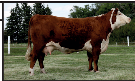
Dorbay Miss Whitney 411W Dam of Lot 31

TH 122 71I VICTOR 719T TH 14S 103R MEGAN 133U MOHICAN MINT 19M ASH MELODY 211M MC RANGER 9615 REMITALL CATALINA 24H REMITALL NIGHTHAWK 100N EJM MISS KOOTENAY GAL 54M