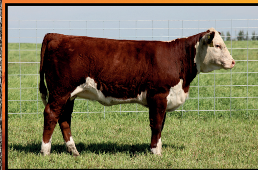
Lot 2 - Remitall West Marvel ET 44A