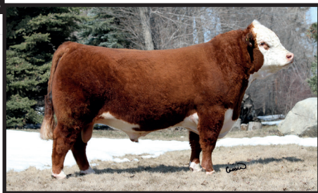
SHF Wonder M326 W18 ET Sire of Lot 32

A proven mating that has delivered very special results. Check out full sibs to this mating that sell as lots 7 and 8, they are highly pigmented, dark red, stout, and eye appealing. A can't miss opportunity here. Seeing as we got bulls you will probably get heifers.