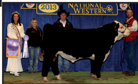
TDP Crossover Z400

A real interesting mating here that will put you at the forefront of genetics in the Hereford breed. The dam Marvel 78T is the dam of champions Game Day 74Y and Chicago 83Y and lead off lot 1 bull in this sale Havana 33A. The sire Crossover is the 2013 Denver National Reserve Bull calf champion. Marvel 78T is owned with Broadlawn Farms MS.