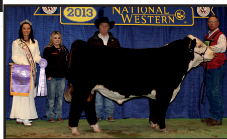
TDP Crossover Z400 Sire of Lot 31

Here is an exciting mating with a huge amount of potential. The National champion Whitney 411W female mated to Crossover Z400 the 2013 Denver reserve bull calf champion. These two complement each other so well, can't wait see the results. It could be ground breaking.