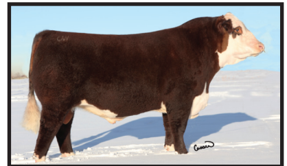
Harvie Traveler 69T

A cow that always catches the eye of visitors to Remitall West. Goggled with extra pigment and a quality udder attachment. Her sire Traveler 69T is a household name in the Hereford breed. Her goggle eyed heifer calf at side is exceptionally long fronted and feminine. Sells bred May 18 to Remitall West Game Day ET 74Y the 2012 WHC Grand Champion Bull.