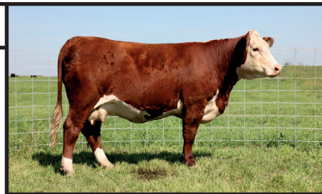
Remitall West Marvel ET 76Y

STAR BRIGHT FUTURE 533P ET STAR BONNIE BETH 54N STAR MKS LIMELIGHT 288G HF 43K DUSTY LADY 74M KCF BENNETT 3008 M326 SHF GOVERNESS 236G L37 REMITALL PATRIOT ET 13P REMITALL MAVREL 105N