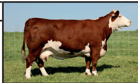
Remitall Marvel 78T

TH 122 71I VICTOR 719T TH 14S 103R MEGAN 133U MOHICAN MINT 19M ASH MELODY 211M REMITALL OLYMPIAN ET 262L REMITALL GINGER 23G REMITALL ONLINE 122L REMITALL MARVEL 202J