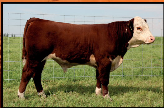
Lot 1 - Remitall West Havana ET 33A

Her Feature Progeny sell as lots 1, 2, 3, 4, 5 & 6 and embryos as lot 27.