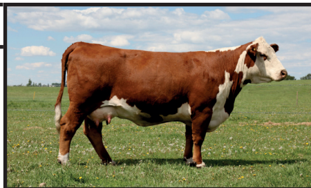
Remitall Rita 13T Dam of Lot 29

KCF BENNETT 3008 M326 SHF GOVERNESS 236G L37 REMITALL PATRIOT ET 13P REMITALL MAVREL 105N REMITALL OLYMPIAN ET 262L REMITALL GINGER 23G REMITALL HERITAGE 89H REMITALL EMPRESS RITA 66E