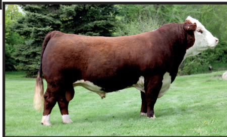
Remitall West Game Day ET 74Y Sire of Lot 29

Can't wait to get the offspring from this mating on the ground. What a special mating this is combining Rita 13T the 2012 WHC Rancher Day Grand Champion female with the 2012 WHC Grand Champion Bull Remitall West Game Day ET 74Y. Combining the Rita cow family with the Marvels, "magic!" Rita 13T is owned with Dorbay Polled Herefords ON.