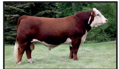
Remitall Constructor 21X

Sire of lot 26. Agribition class winner and 2011 Canadian Jr. National Grand Champion bull. Constructor 21X is owned with LV Farms SK.