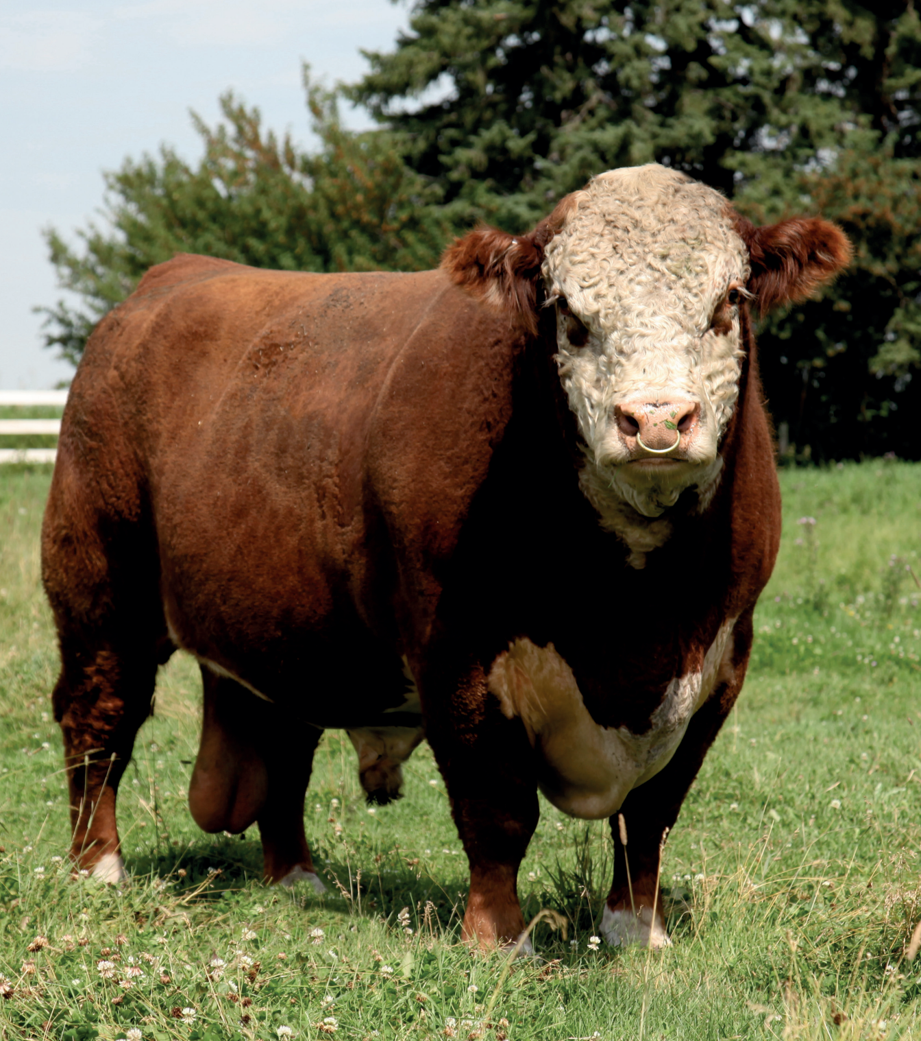
SHF Wonder M 326 W18 ET