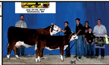
Dorbay Miss Whitney 411W Dam of Lot 32

RRH MR FELT 3008 KCF MISS 459 F284 MM RSM STOCKMASTER 512 SHF INTERSTATE D03 G80 MC RANGER 9615 REMITALL CATALINA 24H REMITALL NIGHTHAWK 100N EJM MISS KOOTENAY GAL 54M