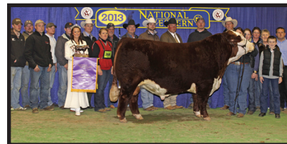
NJW 73S W18 Hometown 10Y ET 2013 Denver National Grand Champion Bull for NJW Polled Herefords and Perks Ranch.

2012 World Hereford Conference Grand Champion Bull. Owned with Bacon Polled Herefords and Glengrove Farm.